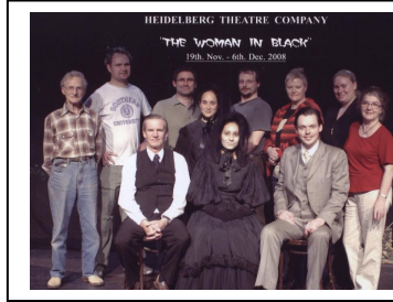
Left: Cast & Crew of The Woman in Black . Right – HTC Youth's A Midsummer Nights Dream

The Woman in Black continues at Heidelberg until the 6 th December and is well worth a visit and if like me you enjoy mysteries of this type you will find much to enjoy.