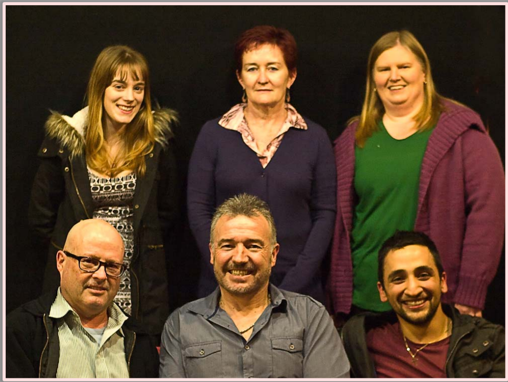
Little Murders Wedding Guests